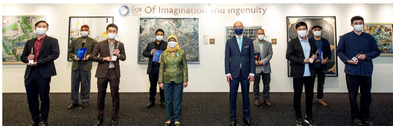
First row centre: President Halimah Yacob and Mr Wee Ee Cheong, Deputy Chairman and Chief Executive Officer, UOB, at the 2021 UOB Painting of the Year Award Ceremony, alongside winners from the Established Artist Category (Singapore)

Bank marks 40 th UOB POY Anniversary with a range of commemorative initiatives, including the launch of the UOB Digital Art Grant and a new iconic awards trophy