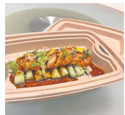
For consumers to adopt Alterpacks, Ms Cheah says the functionality of its containers must be superior to plastic disposables.

More than a third of all food produced goes to waste globally, notes a 2024 report by the United Nations Environment Programme (UNEP). Meanwhile, half of all plastic produced is made for single-use purposes, such as disposable food and drink containers, according to the UNEP. Through Alterpacks, “we're addressing two global, pressing problems at the same time: Food waste and plastic pollution”, says Ms Cheah. “It's the lowest hanging fruit that we can target for the biggest environ-