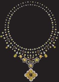
Soo Kee Singapore