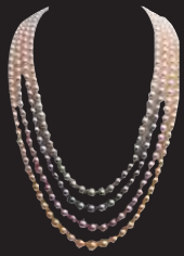
Euro Pearls U.K.